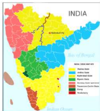
Map 1 : A graphic representation of various regions in the southern peninsula before State reorganisation